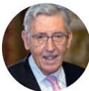
Lord David Howell of Guildford

Our Advisory Board consists of highly experienced professionals who have shaped policy and the management of strategic energy producers worldwide.